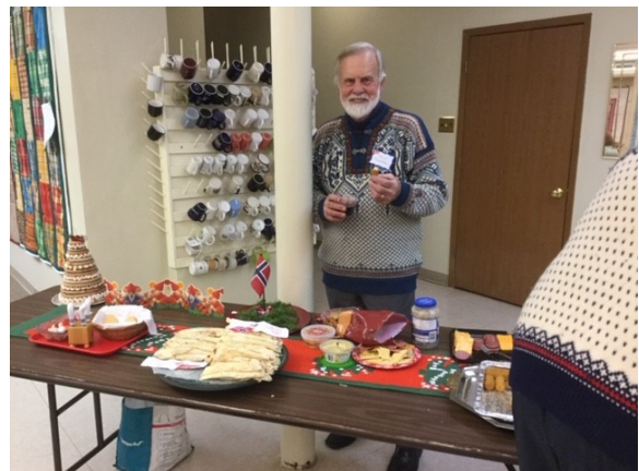
Lefse Table with nisse patrol !